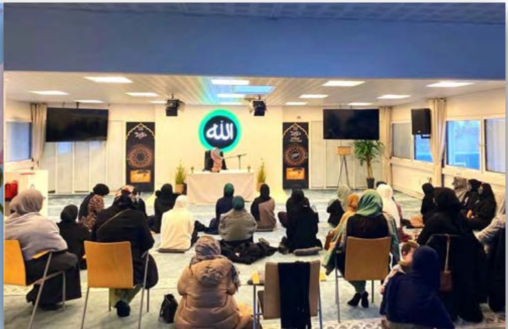
Sisters Gathering in Zawiyah Muhammadiyah Copenhagen, Denmark